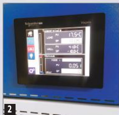
2 Temperature + vacuum profiler