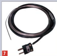
7 Thermocouple J probe