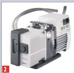
2 Vacuum kit