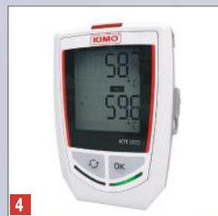
4 Data logger with 2 channels