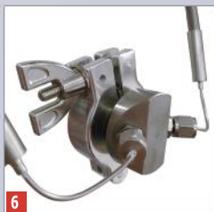
6 Probe shutter