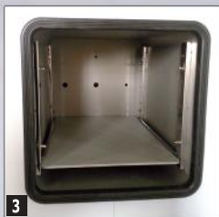
3 Door gasket made of Viton