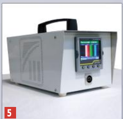
5 Portable paperless recorder with graphical screen